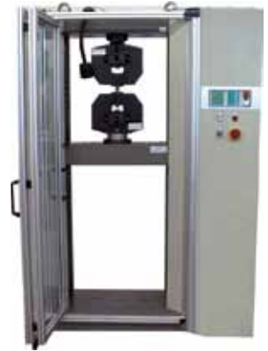
UTS Eurotest - 100 kN