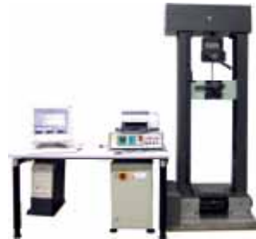
WPM FP - 100 kN