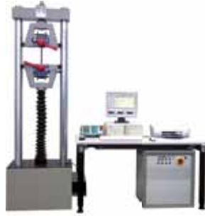
VEB ZD 10/90 - 100 kN