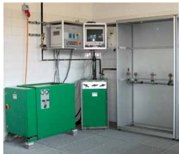
Burst Testing Installation w+b