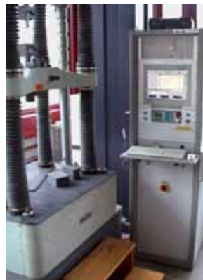
Tinius Olsen 300 kN