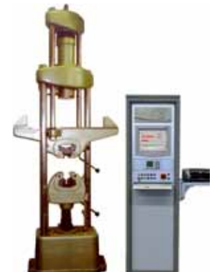
Losenhausen - 400 kN