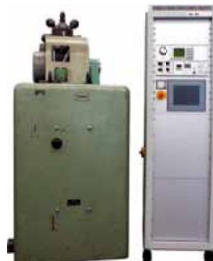
Hydrostatic Pressure Testing Installations