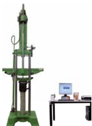
Amsler SZBDA 699 - 400 kN