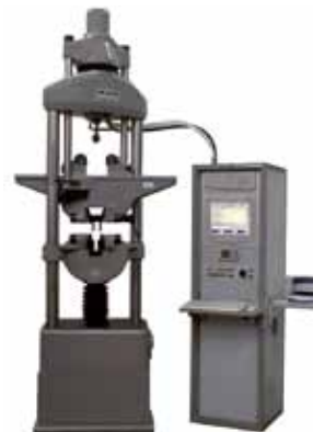
MAN UPM - 400 kN