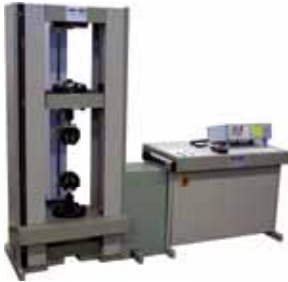
Zwick 1464 - 50 kN