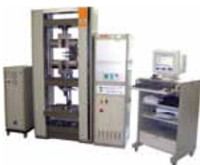
Zwick 1485 - 250 kN