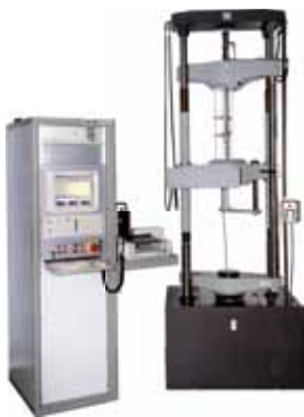
Hydraulic Testing Machines

w+b offers different levels of upgrades to meet the wide variety of testing needs of laboratories and manufacturers.