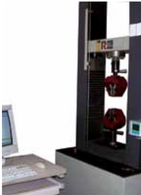
Roell+Korthaus 100 kN