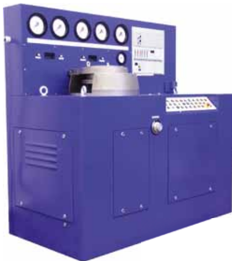
Roell+Korthaus A60 - SF

ernisation systems offered from w+b are modular designed and provide different options. The modernisation spectrum ranges from add-on packages to complete refurbished machines.