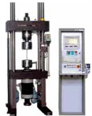
Dynamic Instron 1345 - 500 kN