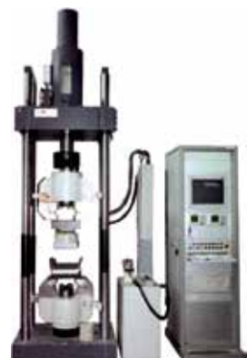
Roell+Korthaus MFL - 600 kN