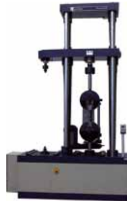
Roell+Korthaus 20/200 kN