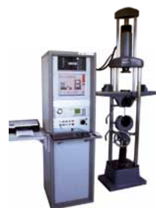
Wolpert U10 - 100 kN