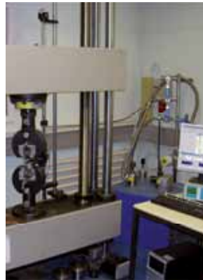
UTS 200 kN