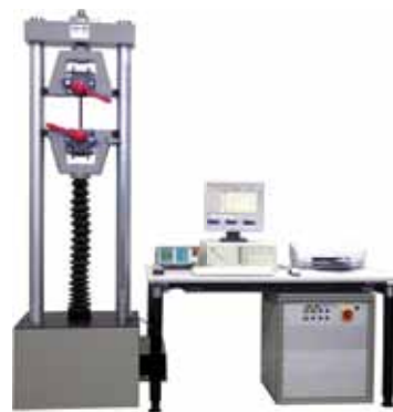
Electromechanical Testing Machines