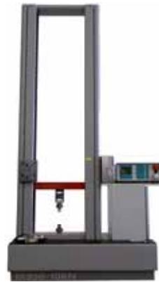
UTM 10 kN