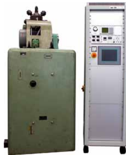
Amsler Pulsator P960