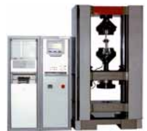
Zwick 1484 - 600 kN