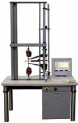
UTS 5 kN