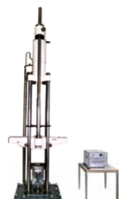
Amsler SZBDA 401 - 1000 kN