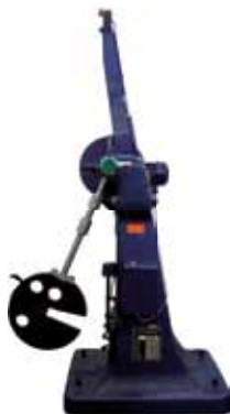
Pendulum Impact Testers