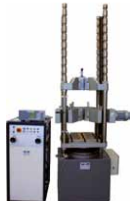
Tinuis Olsen L - 600 kN