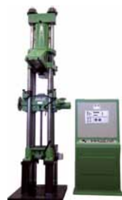
Amsler PZBDA 401 - 500 kN