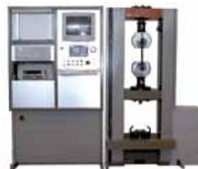
Zwick 1474 - 100 kN