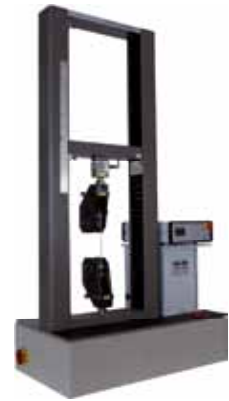
Quicktest 25 kN