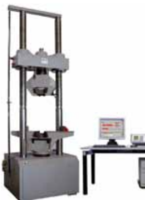
Wolpert THZ - 725 - 400 kN