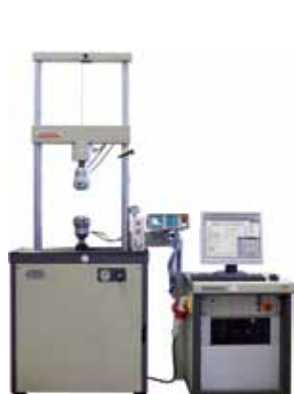
Schenk-Hydropuls PSA - 40 kN