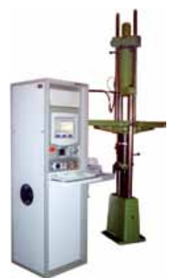
Amsler SZBDA 599 - 200 kN