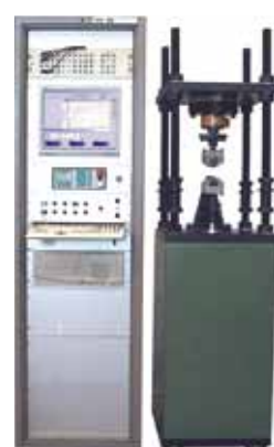
Wolpert 20 kN