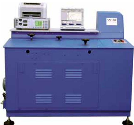
Amsler BP 717 mod. w+b