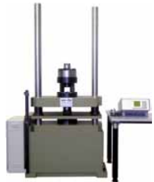
Zwick 1488 - 200 kN