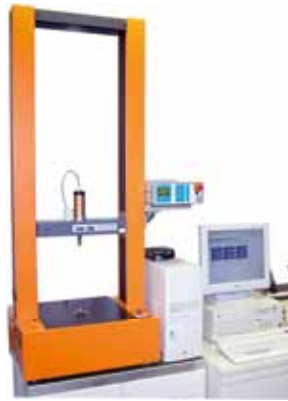
L 10 kN