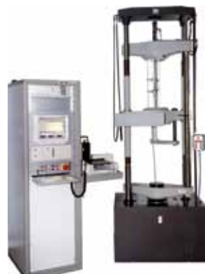
WPM ZD - 1000 kN