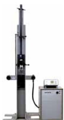
Amsler Z46 - 50 kN