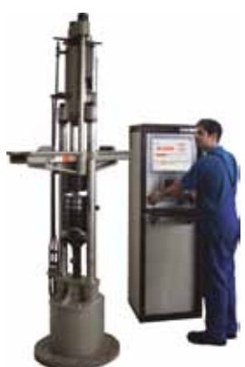
Amsler ZBD57 - 200 kN