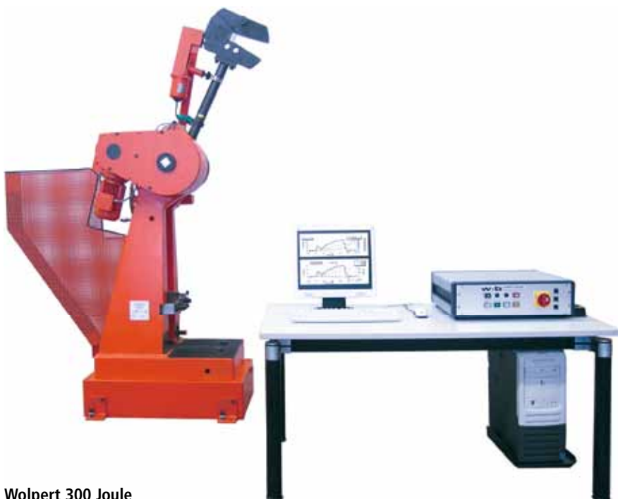
Wolpert 300 Joule

lated products including sample preparation, sample cooling and impact tester indirect verification accessories completing the laboratories requirements.